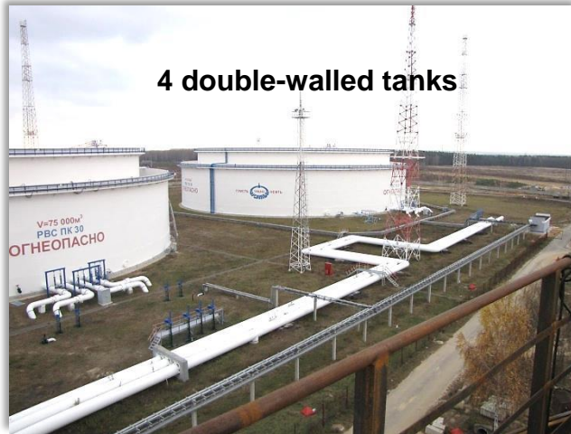
4 double-walled tanks

NATIONAL PETROLEUM RESERVE DEPOTS ADMINISTRATION, ETHIOPIA 24 walls for 12 tanks, 5600 cub.m each. Fabricated by rolling method