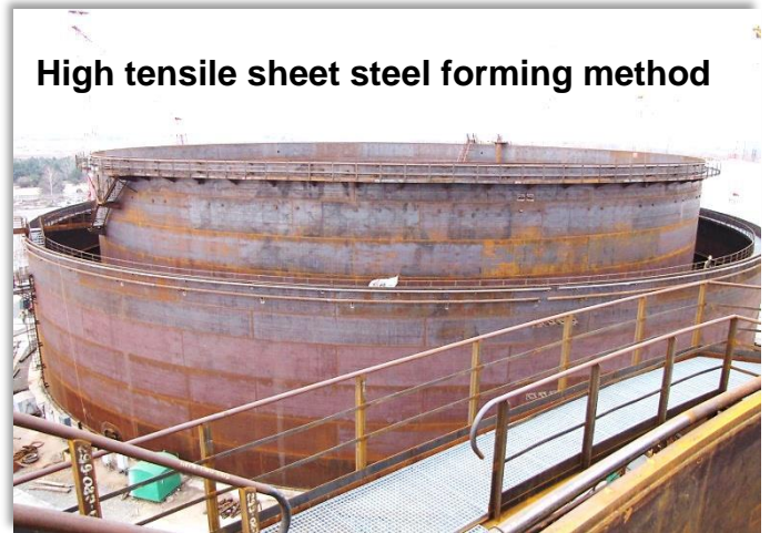
High tensile sheet steel forming method